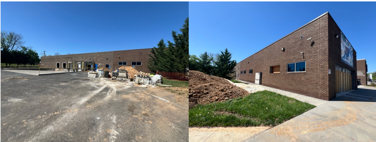
24 th Street (left of tree and right of tree)

Current wall photos (wall repair/construction will be complete prior to start of mural)