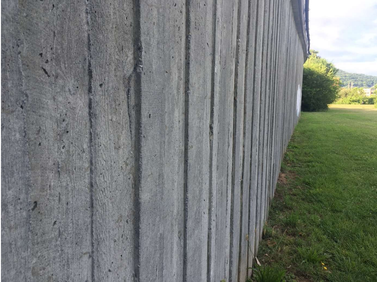
Concrete wall texture, established by alternating raised plank pattern.

The selected projects will create a low-maintenance solution that reflects and advances the sensibility of the space. Specific opportunities are for the work to: