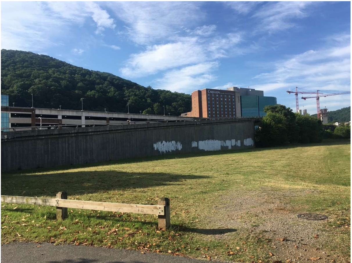
The site, with Mill Mountain and Carilion Clinic Roanoke Memorial Hospital beyond.