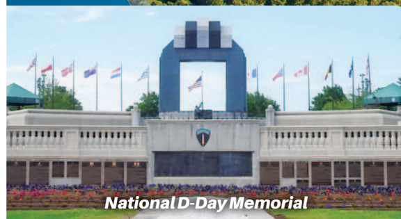
National D-Day Memorial

To the east and west are bustling cities, but in between is pure bliss. Beauty that will take your breath away and stories of bravery that will leave you speechless.